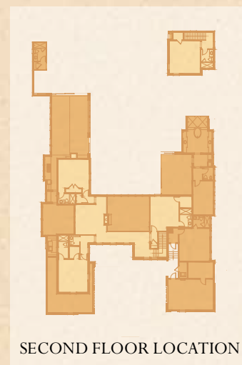
SECOND FLOOR LOCATION